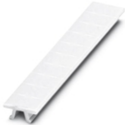
Zack marker strip, 10-section, vertically labeled with the consecutive numbers: 61 ... 70, white, width: 6 mm

Please be informed that the data shown in this PDF Document is generated from our Online Catalog. Please find the complete data in the user's documentation. Our General Terms of Use for Downloads are valid ( http://phoenixcontact.com/download )